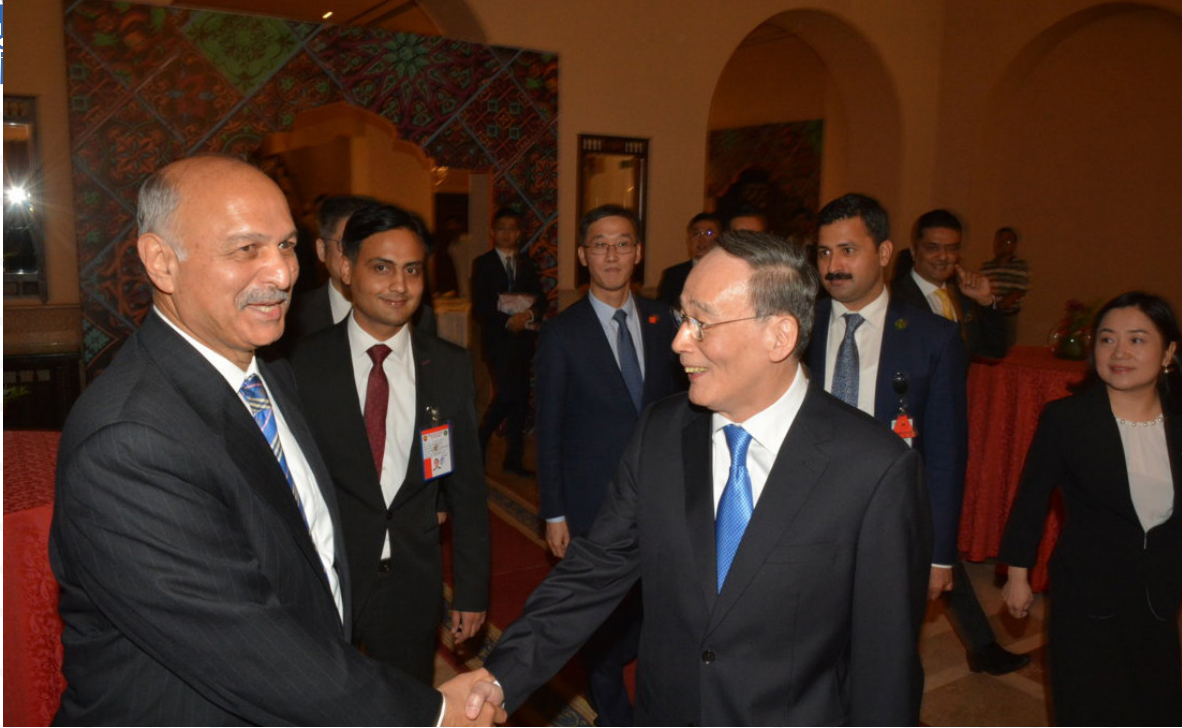
Senator Mushahid Hussain receives H.E. Wang Qishan, Vice President of China.