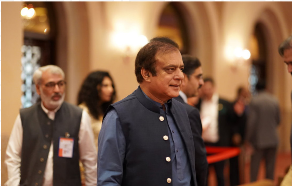
Mr. Syed Shibli Faraz, Leader of the House, Representative of Prime Minister in the Senate of Pakistan.