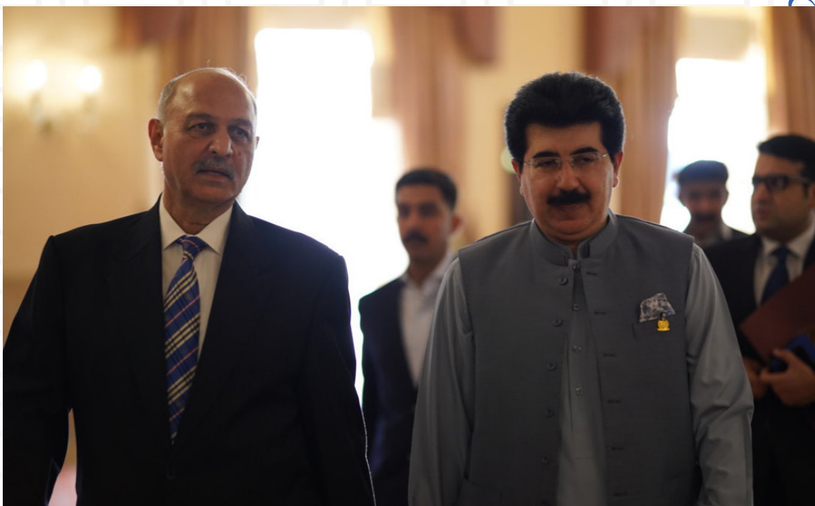
Senator Mushahid Hussain with Mr. Muhammad Sadiq Sanjrani, Chairman Senate of Pakistan.