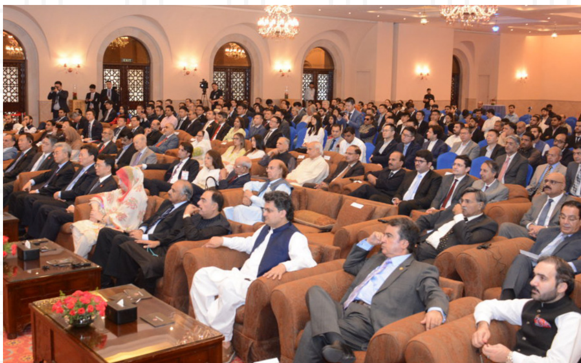
Diverse audience, from all walks of life.