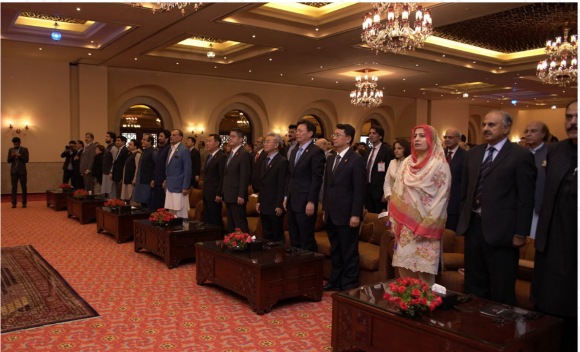
Guests standing at attention as a mark of respect for the national anthems of Pakistan and China.