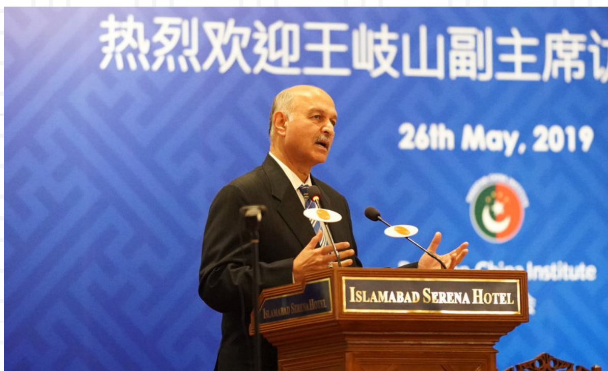
Senator Mushahid Hussain giving the inaugural speech.