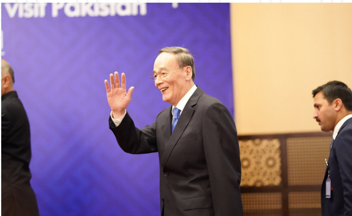
H.E Wang Qishan responds to the applause of the audience.