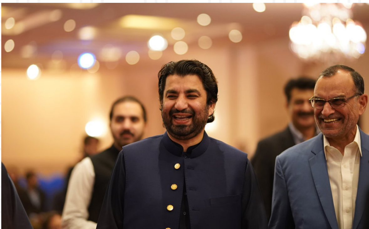
Mr. Qasim Suri sharing a light moment with Mr. Azam Khan Swati, Federal Minister for Parliamentary Affairs.