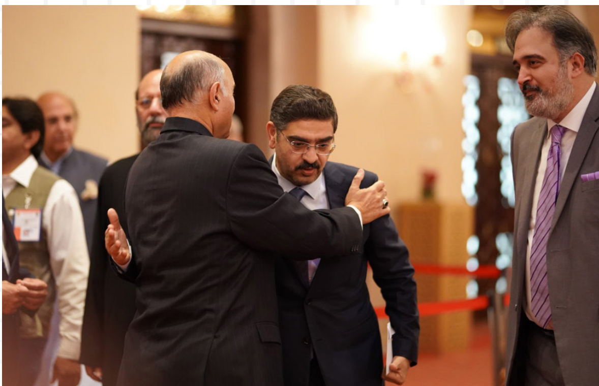
From L-R: Senator Mushahid Hussain, Chairman PCI and Senate Foreign Affairs Committee; Senator Anwar Ul Haq Kakar from Balochistan Awami Party (BAP) ; Mr. Sher Ali Arbab, Chairman Parliamentary Committee on CPEC.