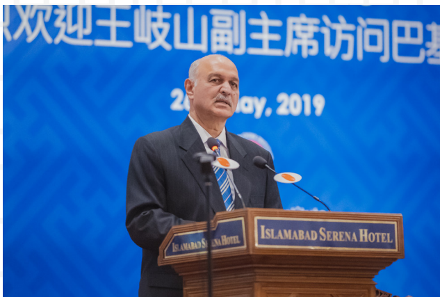
Senator Mushahid Hussain, Chairman PCI and Senate Foreign Affairs Committee giving the inaugural speech

to be exclusively devoted to promoting people-to-people connectivity with China through its various initiatives.