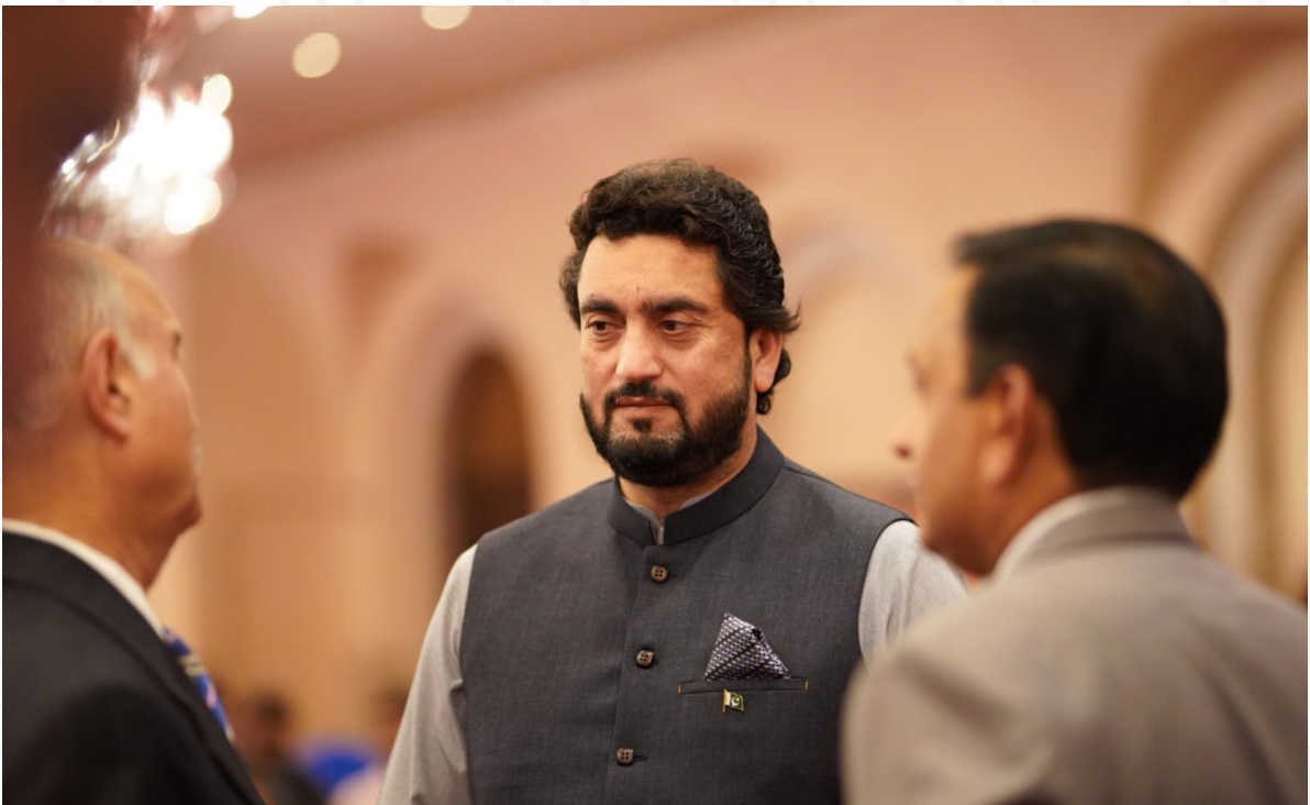
Mr. Shehryar Khan Afridi, Minister of State for States and Frontier Regions (SAFRON) from PTI.