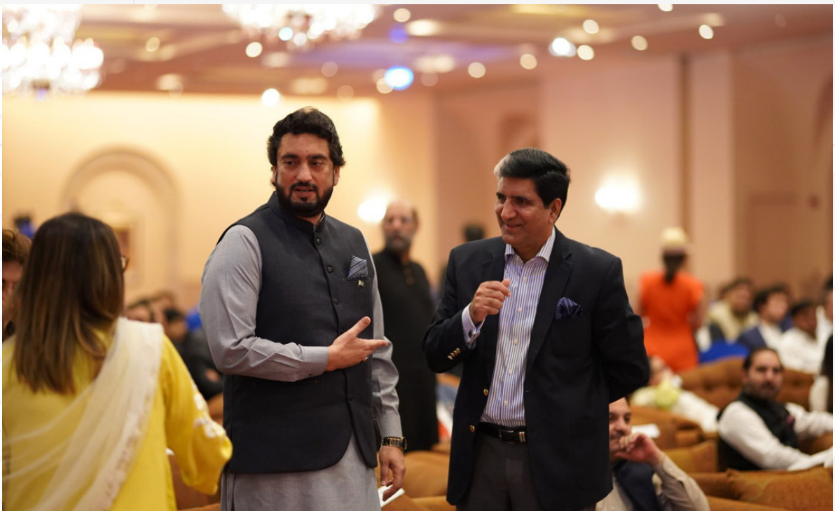
Mr. Shehryar Khan Afridi with Senator Javed Abbasi from PML-N.