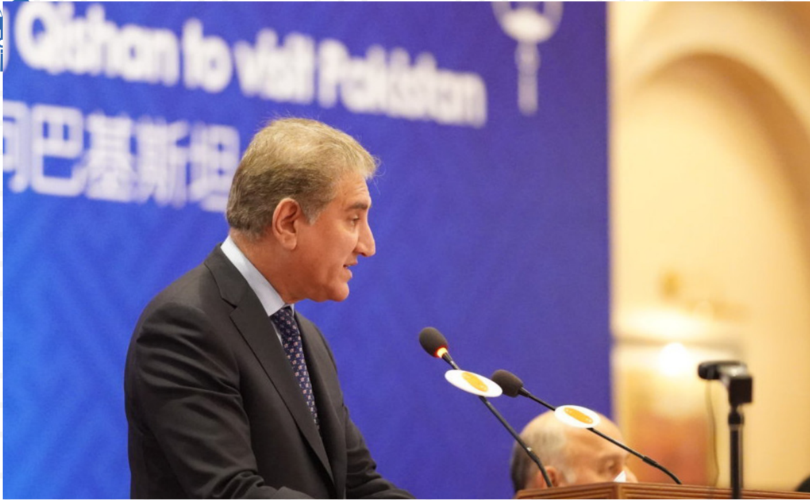
Mr. Shah Mehmood Qureshi addressing the Friends of Silk Road Forum.