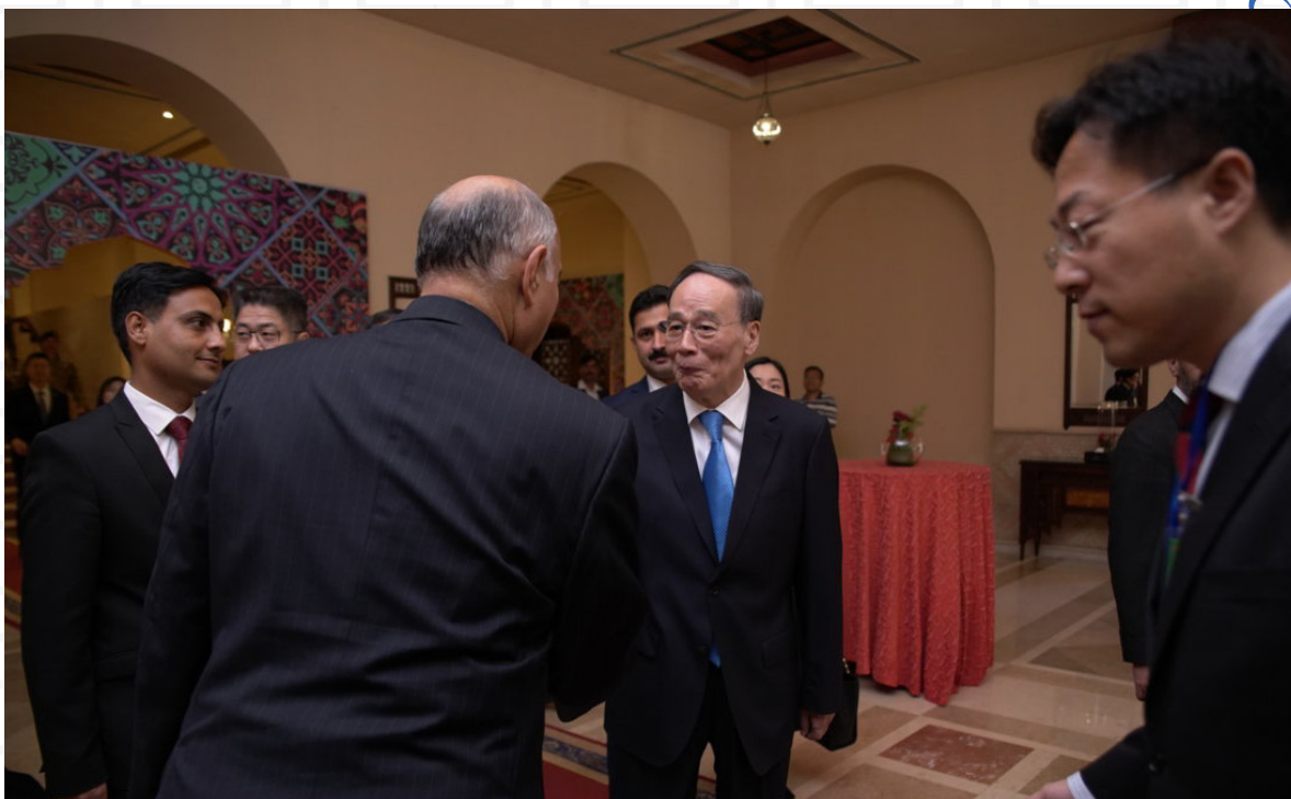
Senator Mushahid Hussain welcomes His Excellency, Wang Qishan, Vice President of China.