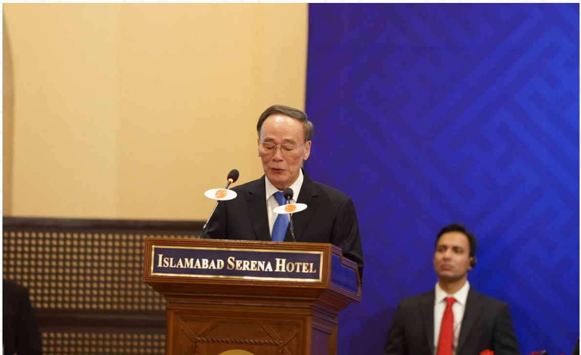
H.E. Wang Qishan addressing the Friends of Silk Road Forum.