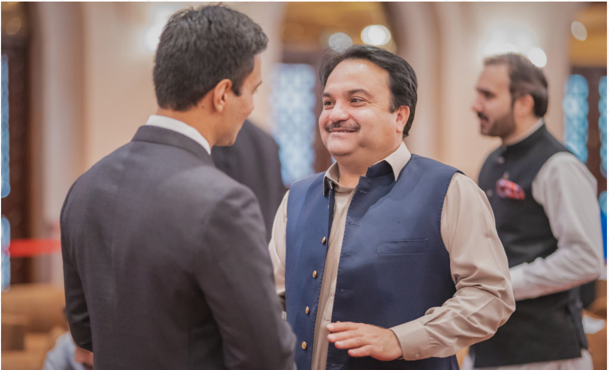
Senator Sajjad Hussain Turi, Minister of State, Chief Whip of PTI talking to Mr. Mustafa Hyder Sayed. In the background, Senator Mirza Muhammad Afridi (FATA), co-owner of Haier-Ruba Economic Zone can also be seen.