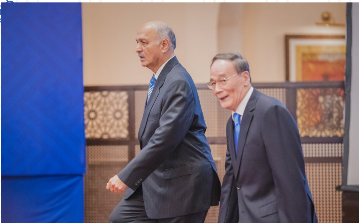
Senator Mushahid Hussain and H.E. Wang Qishan, Vice President of China walking to the stage.