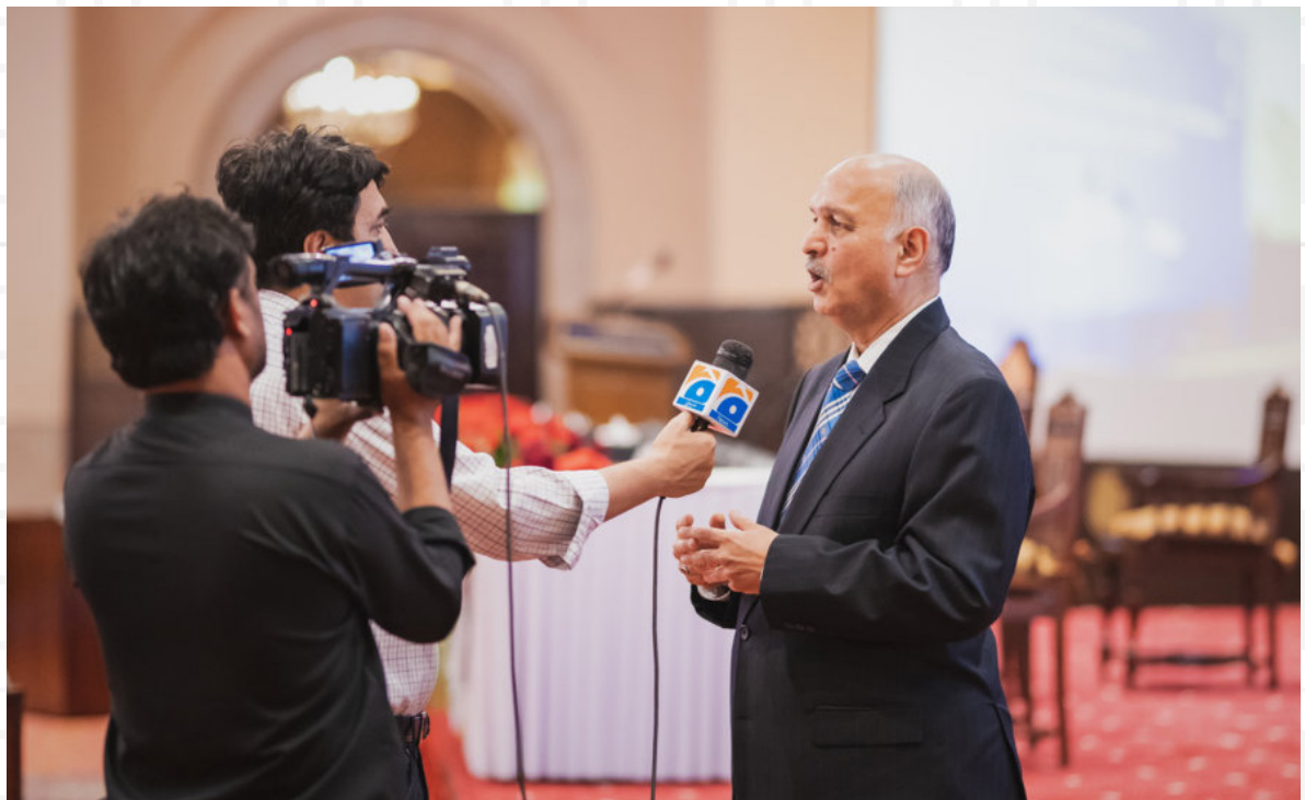
Senator Mushahid Hussain being interviewed by the most popular Geo TV Network, regarding the Friends of Silk Road Forum.