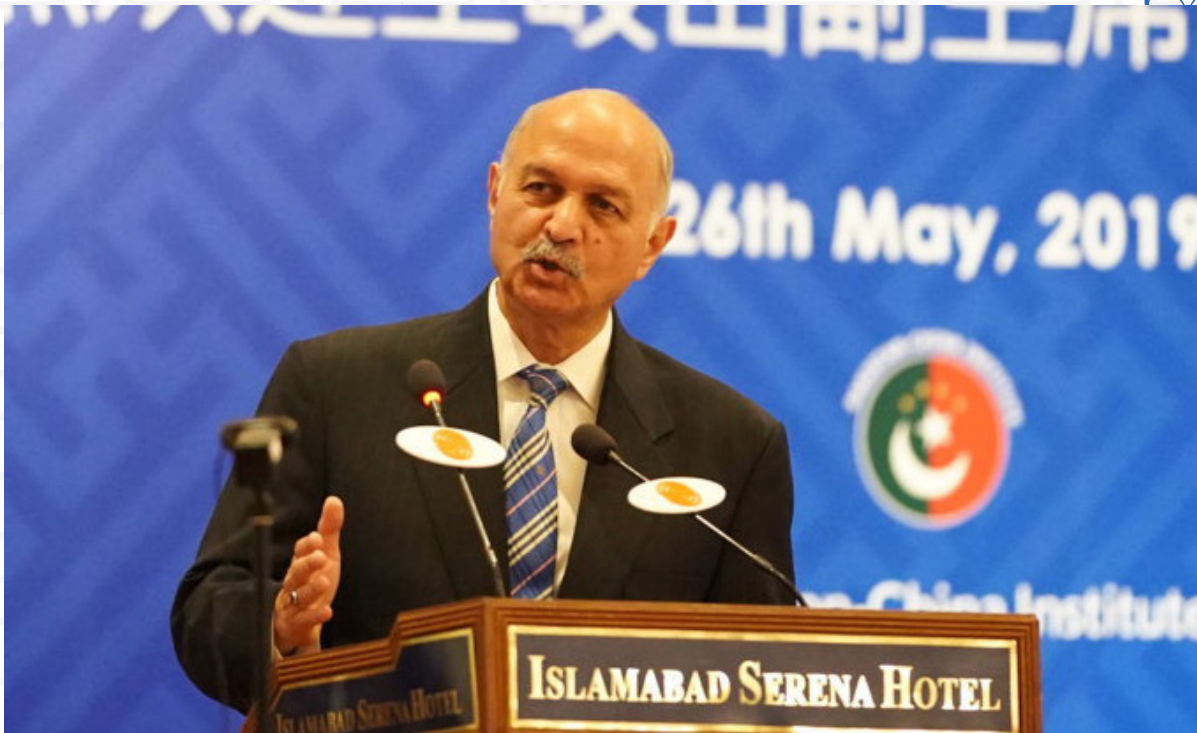
Senator Mushahid Hussain giving the inaugural speech.