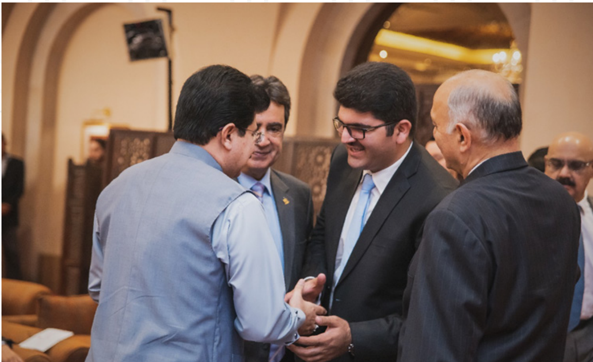
Mr. Shah Mehmood Qureshi in a lighter mood with Mr. Muhammad Sadiq Sanjrani. Senator Mushahid Hussain looks on.