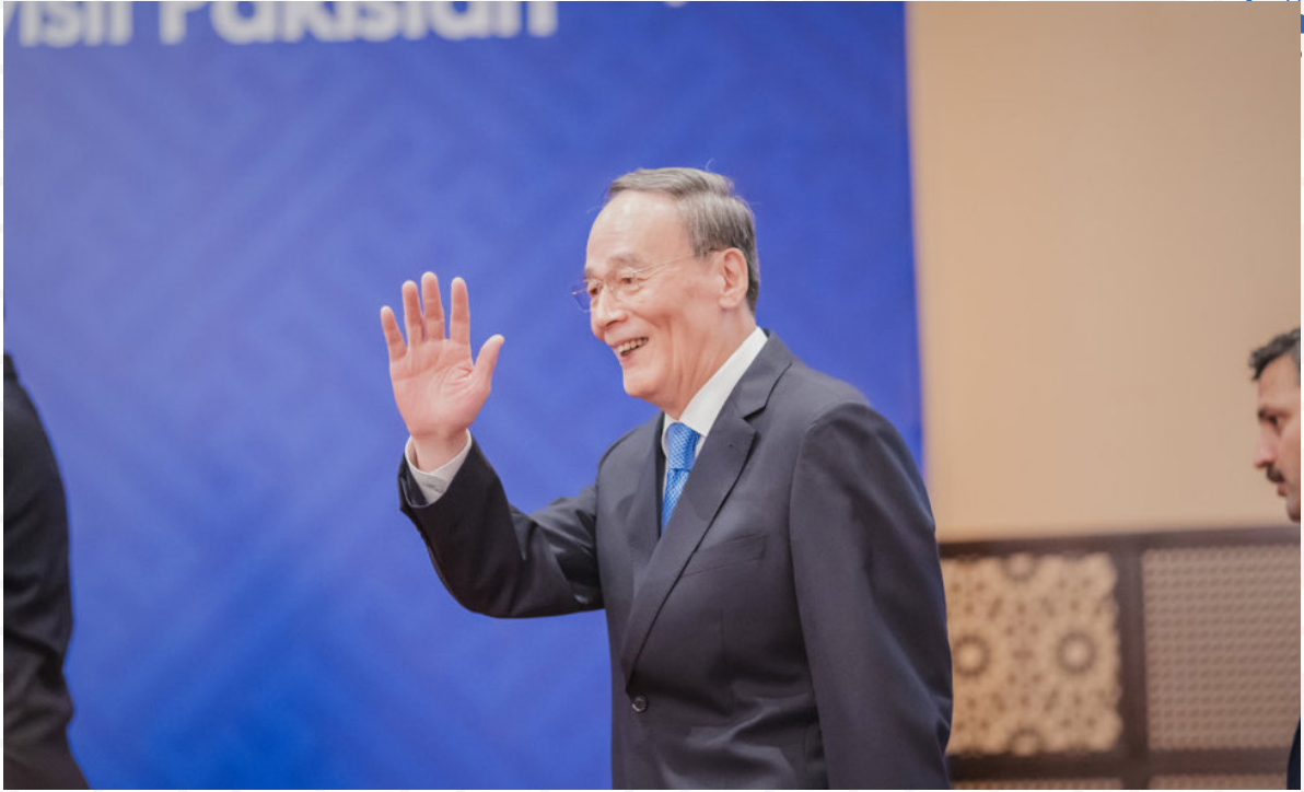
H.E. Wang Qishan, Vice President of China, waving at the welcoming guests.