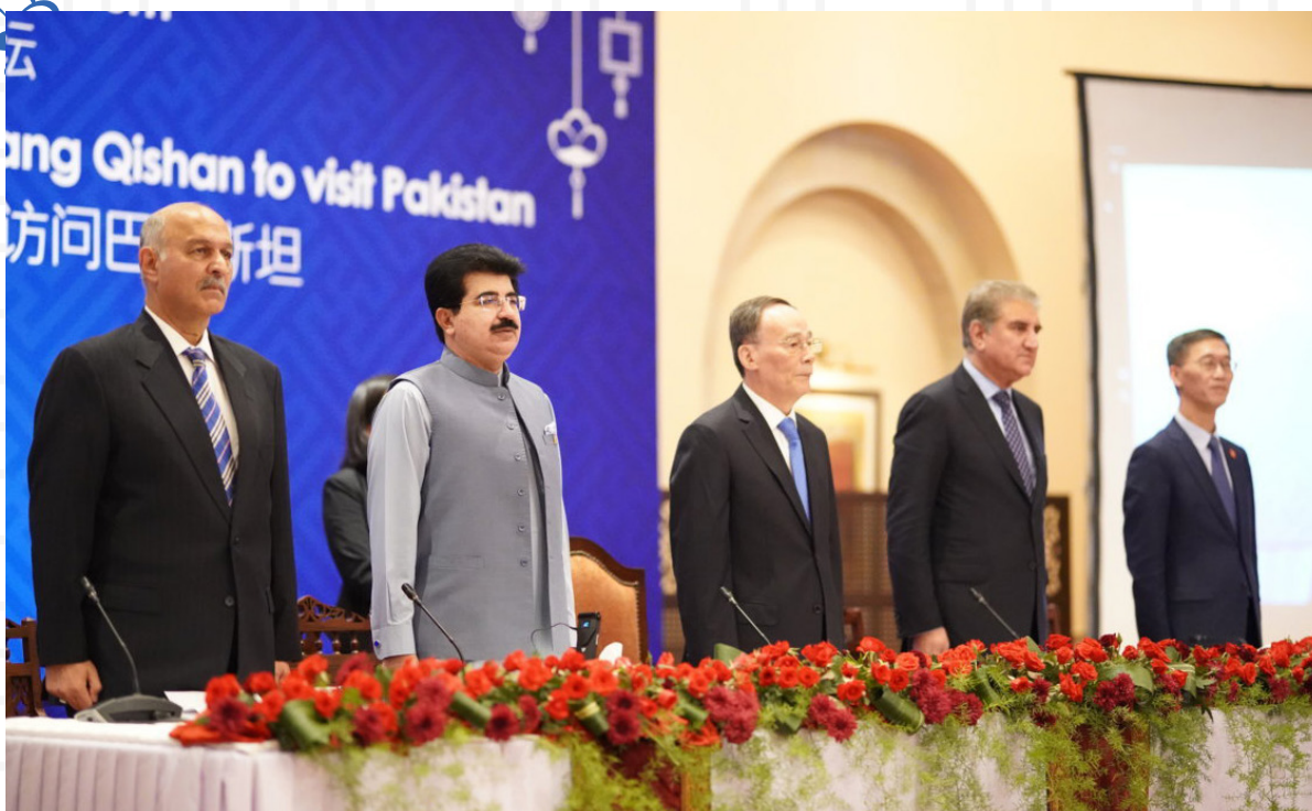
From L-R: Senator Mushahid Hussain; Mr. Muhammad Sadiq Sanjrani ; H.E. Wang Qishan ; Mr. Shah Mehmood Qureshi ; H.E. Yao Jing, Ambassador of China to Pakistan.