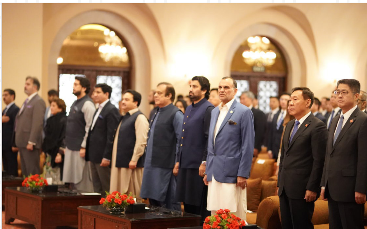
VIPs standing at attention at the National Anthems.