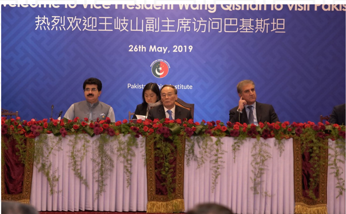
From L-R: Mr. Muhammad Sadiq Sanjrani; H.E. Wang Qishan, Vice President of China and Mr. Shah Mehmood Qureshi.