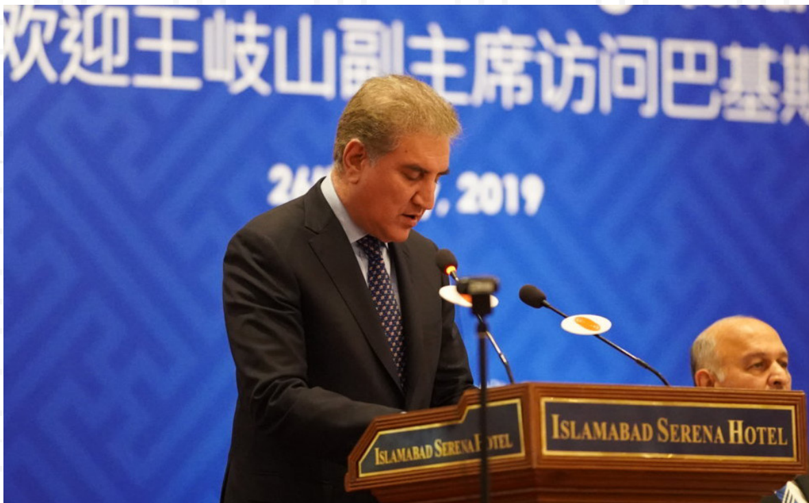
Mr. Shah Mehmood Qureshi addressing the Friends of Silk Road Forum.