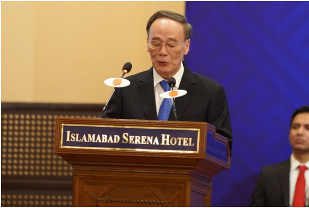
H.E. Wang Qishan, Vice President of China.

monks such as Tu Cheng and Kumarajiva of the Wei and Jin Dynasties, Faxian of the Eastern Jin Dynasty and Xuanzang of the Tang Dynasty, through their pilgrimages across the region and translations of Buddhist scriptures, left behind many widely told stories of China-Pakistan friendly exchanges.” He went onto say that ‘Friends of Silk Road’ is a continuation of these exchanges. While discussing CPEC in context of the international situation, he emphasized China’s commitment to “open, green and clean cooperation that follows a high standard, people-centered and sustainable approach.” He concluded by invoking Muhammad Ali Jinnah’s quote, “We are not afraid of the deep sea or the fire, because we believe in the sun and the future,” as a driving force for closer Pakistan-China cooperation.