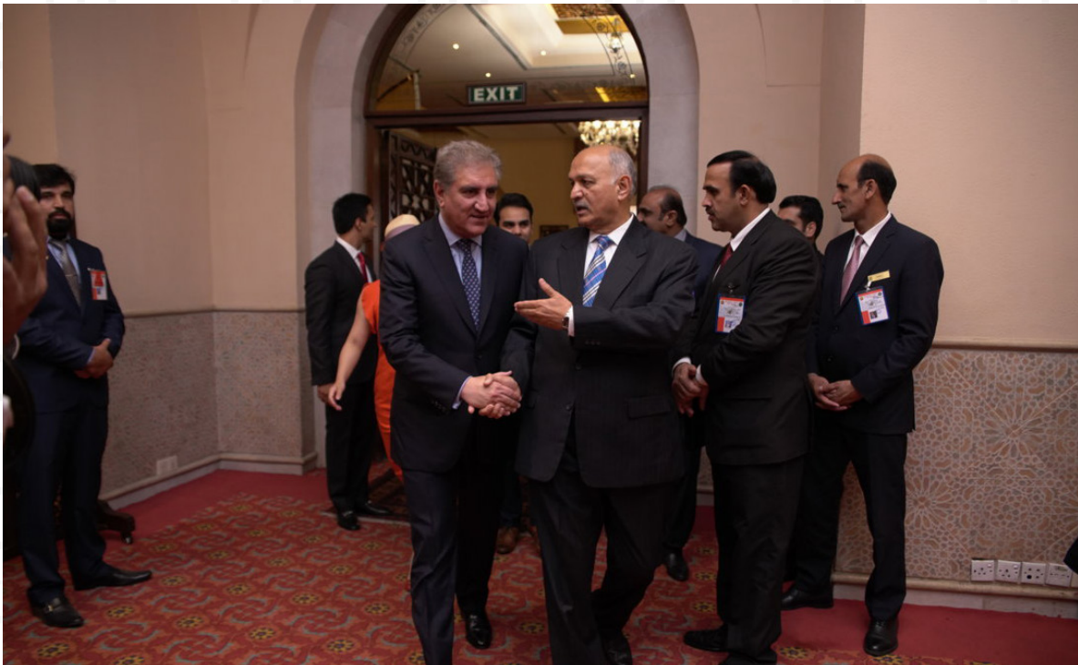
Mr. Shah Mehmood Qureshi being welcomed on arrival by Senator Mushahid Hussain.