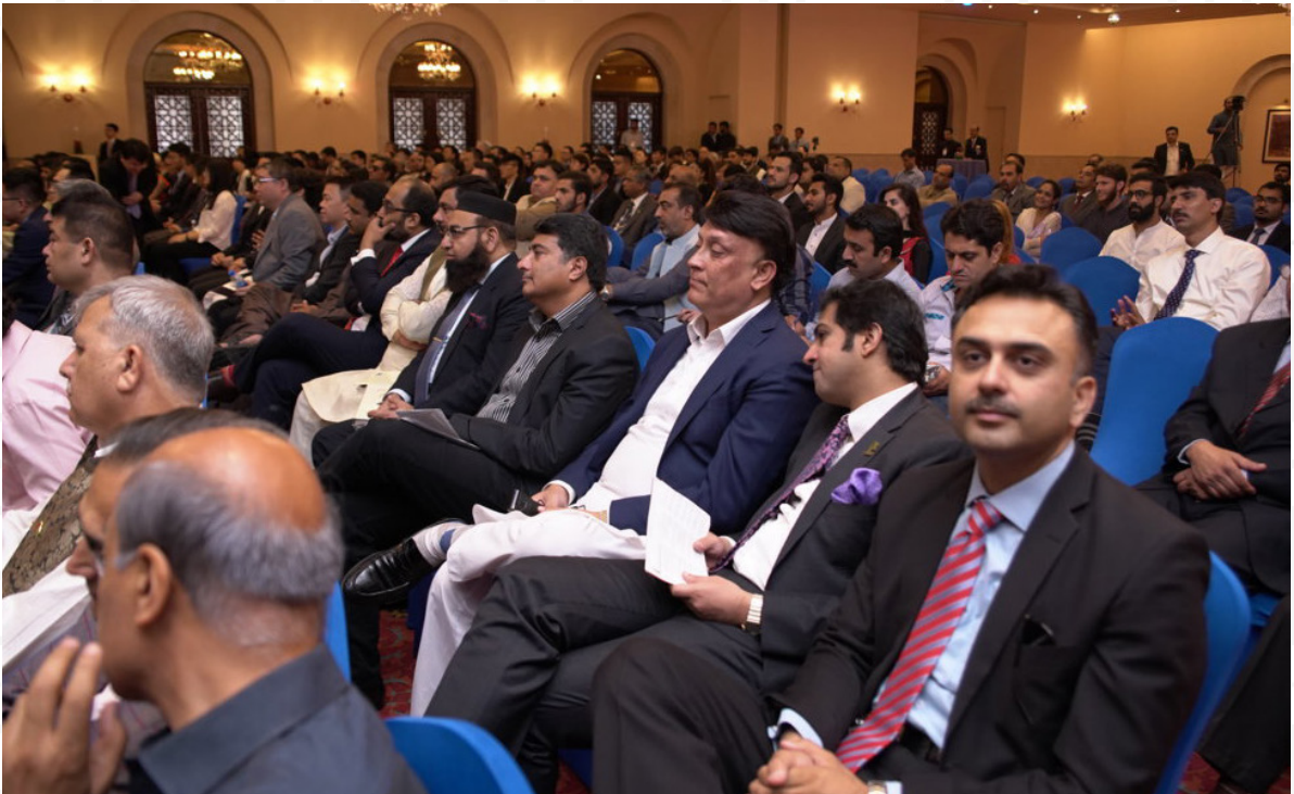
Section of the audience listening to the seminar with rapt attention.