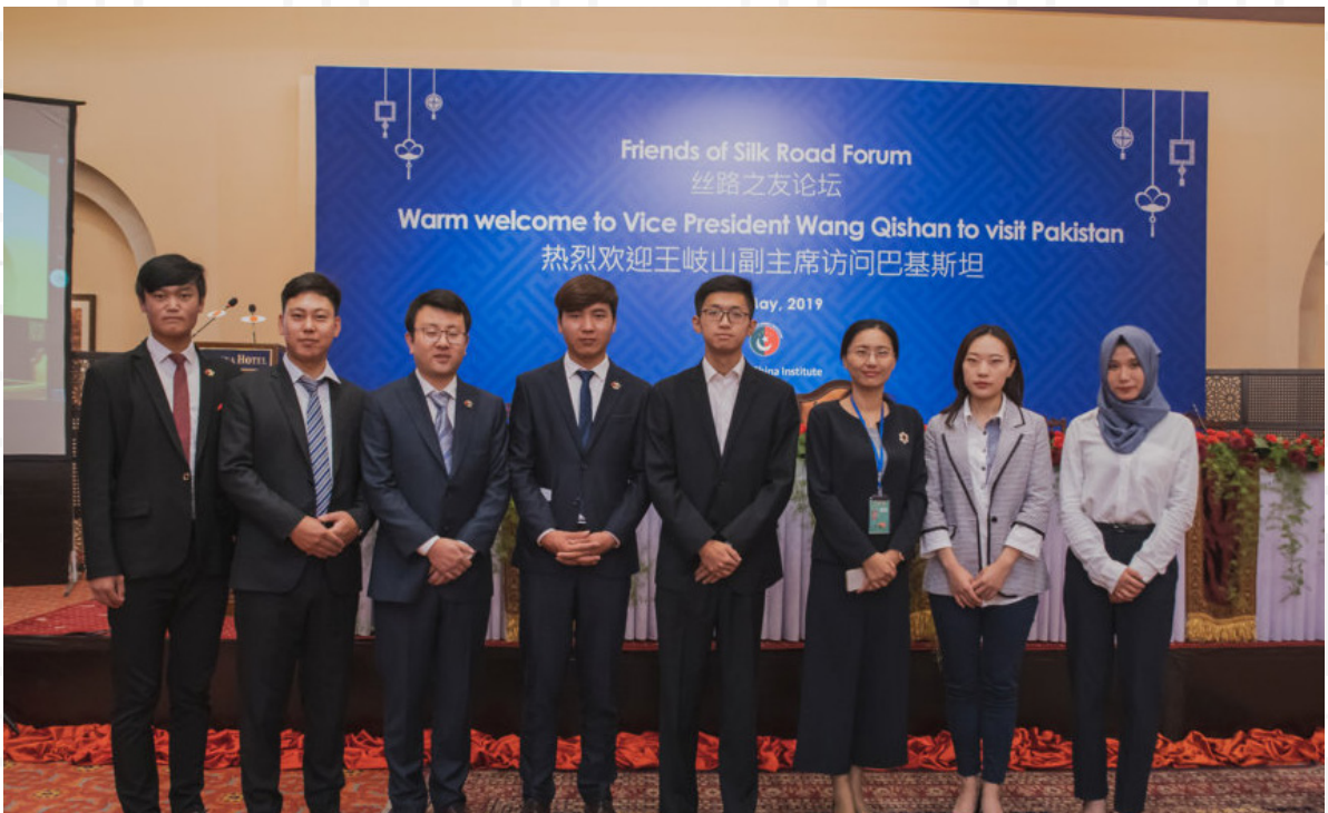
Chinese students studying in Pakistan.