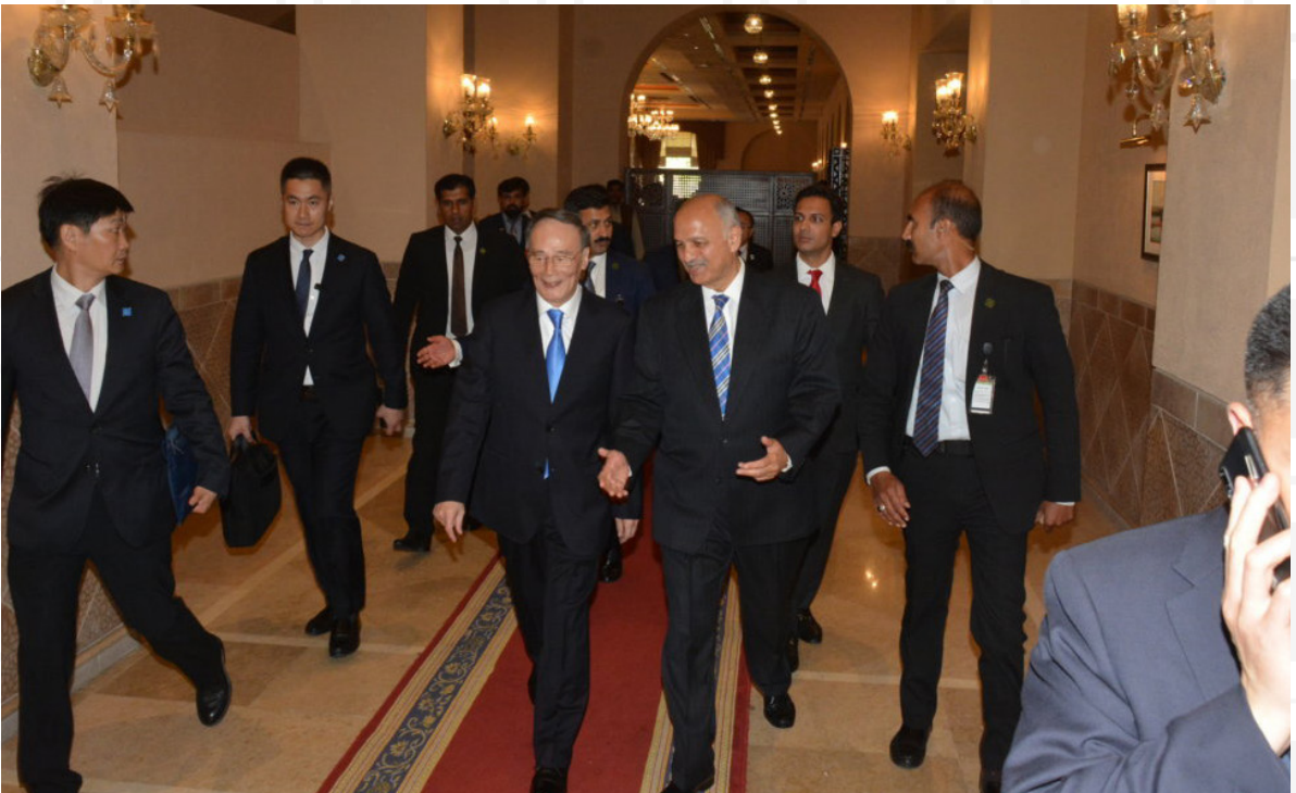
H.E. Wang Qishan, Vice President of China, is all smiles after a highly successful function.