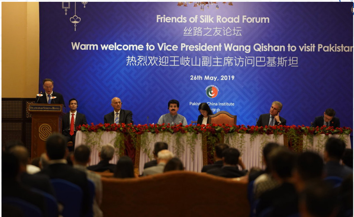
H.E. Wang Qishan addressing the Friends of Silk Road Forum.