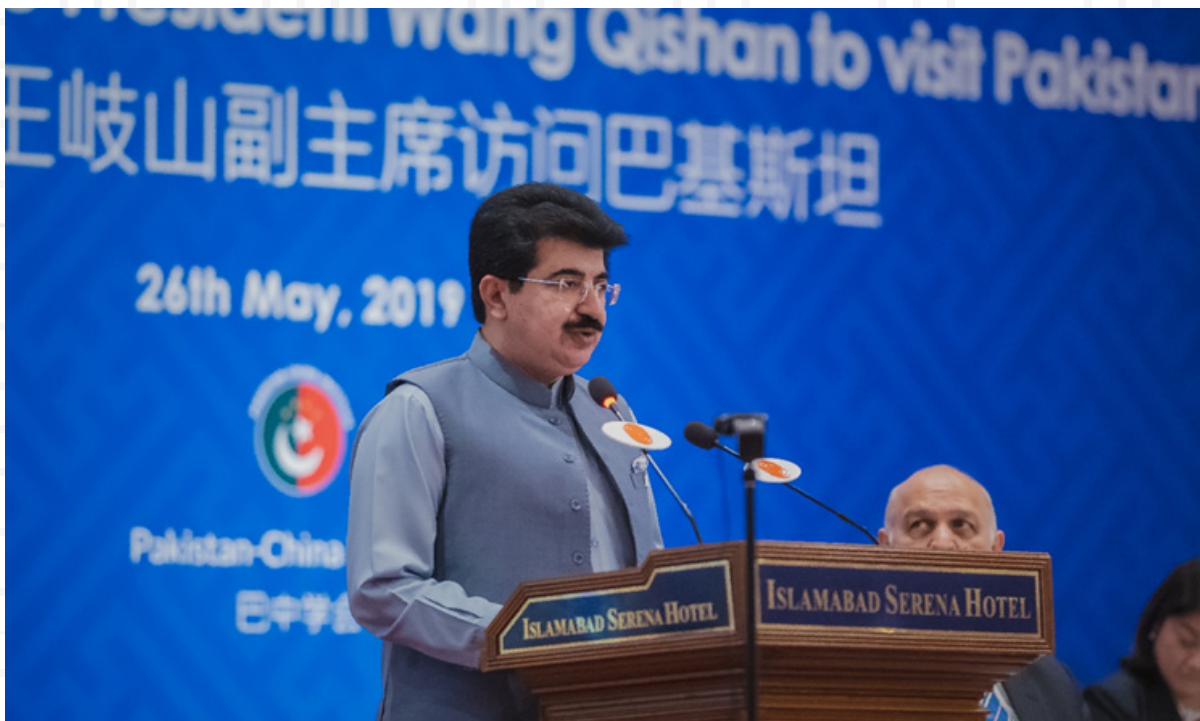
Mr. Muhammad Sadiq Sanjrani addressing the Friends of Silk Road Forum.