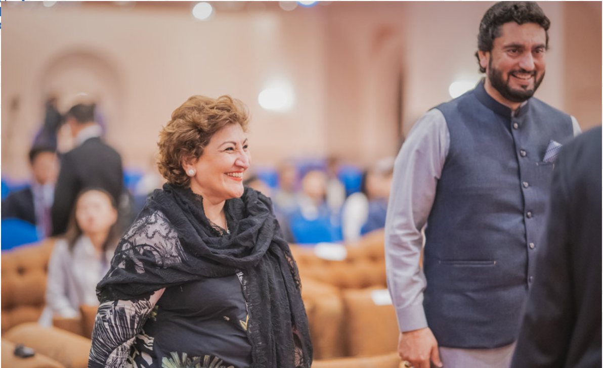
Senator Nuzhat Sadiq, Chairperson PML-N Women Wing with Mr. Shehryar Khan Afridi.