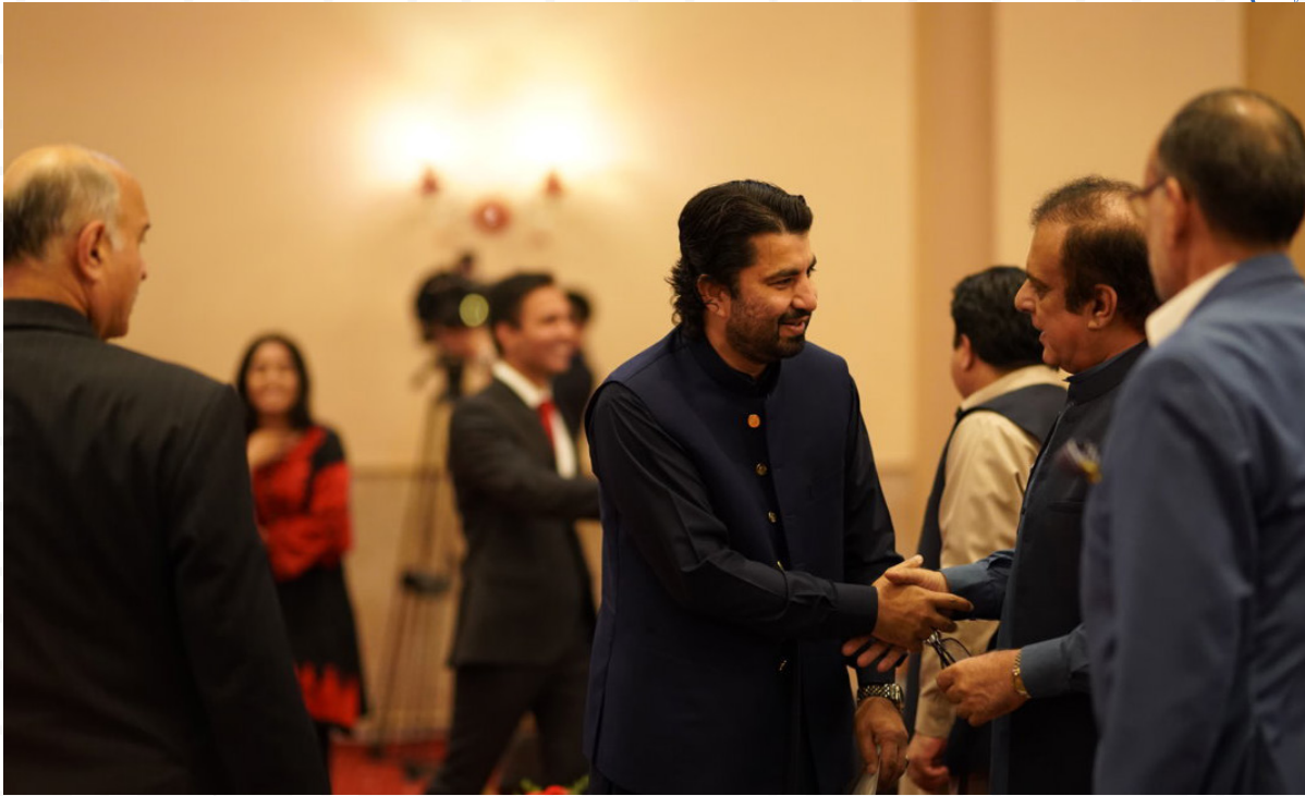
Mr. Qasim Suri, Deputy Speaker National Assembly being greeted by Mr. Syed Shibli Faraz.