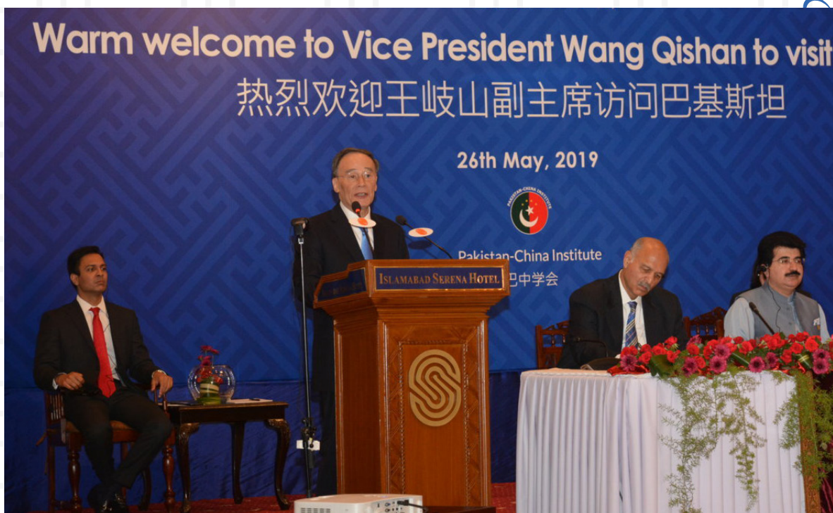
H.E. Wang Qishan, Vice President of China making a speech.