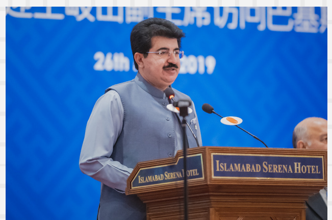
Mr. Muhammad Sadiq Sanjrani, Chairman Senate of Pakistan addressing the audience

In his speech, the Chairman Senate, Sadiq Sanjrani acknowledged the importance of 'Friends of Silk Road' saying that "Pakistan is first among BRI countries to launch this forum, to create awareness about the benefits and opportunities of CPEC and BRI". He underlined that CPEC itself symbolizes the common vision of inclusive, connected and integrated Asia, endorsing President Xi Jinping's proposal at the CDAC to "consolidate the cultural foundation for a shared future".