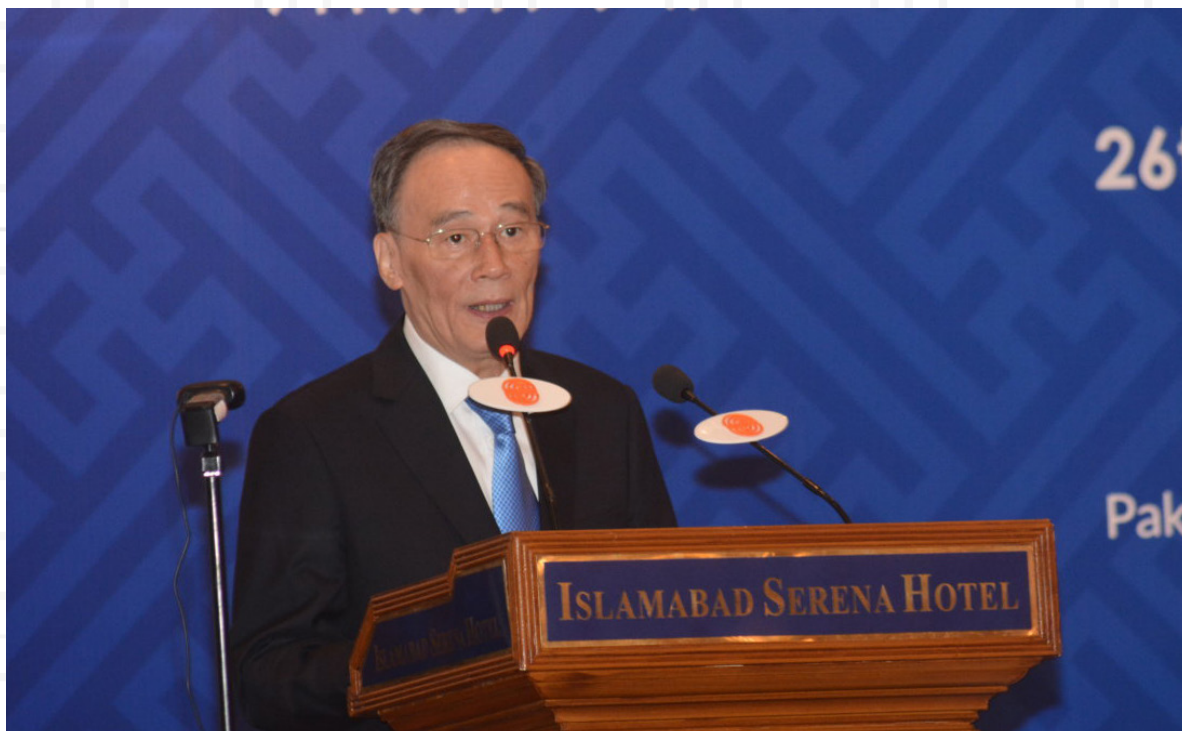
H.E. Wang Qishan, Vice President of China.