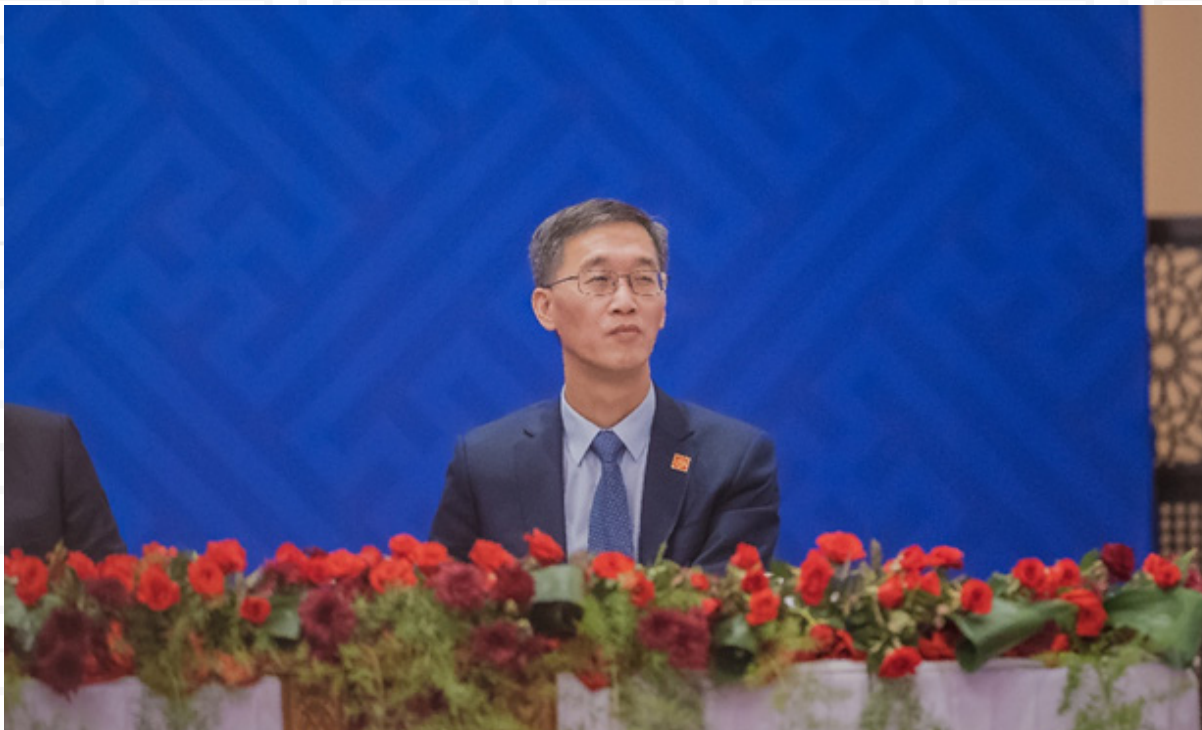
H.E. Yao Jing, Ambassador of China.