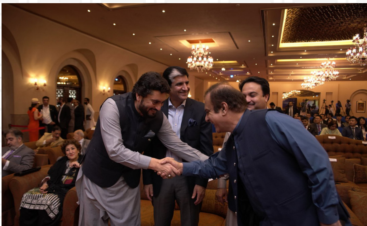
Mr. Shehryar Khan Afridi, Minister of State for States and Frontier Regions (SAFRON) shaking hands with Mr. Syed Shibli Faraz, Leader of the House, Representative of Prime Minister in the Senate of Pakistan. Back, L-R: Senator Javed Abbasi (PML-N) and Senator Sajjad Hussain Turi from FATA.