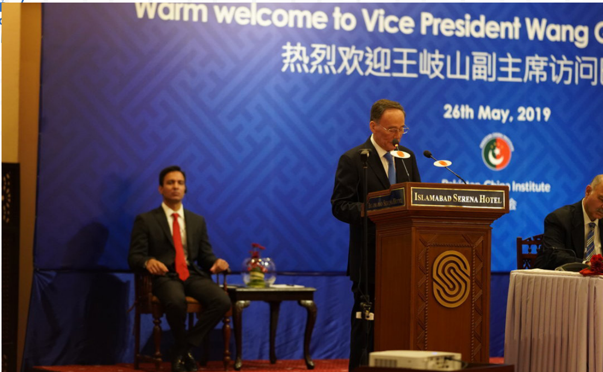
H.E. Wang Qishan addressing the Friends of Silk Road Forum.