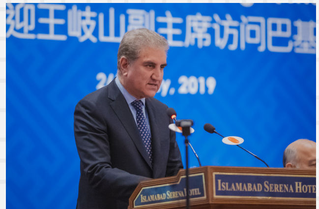
Mr. Shah Mahmood Qureshi, Federal Minister for Foreign Affairs, addressing the audience

peace, harmony and shared prosperity". He further said that CPEC is entering a new phase, in which local communities will be the main beneficiaries, reminding the participants that Pakistan and China are celebrating 2019 as the year of Sister City relations to promote people-to-people interaction.