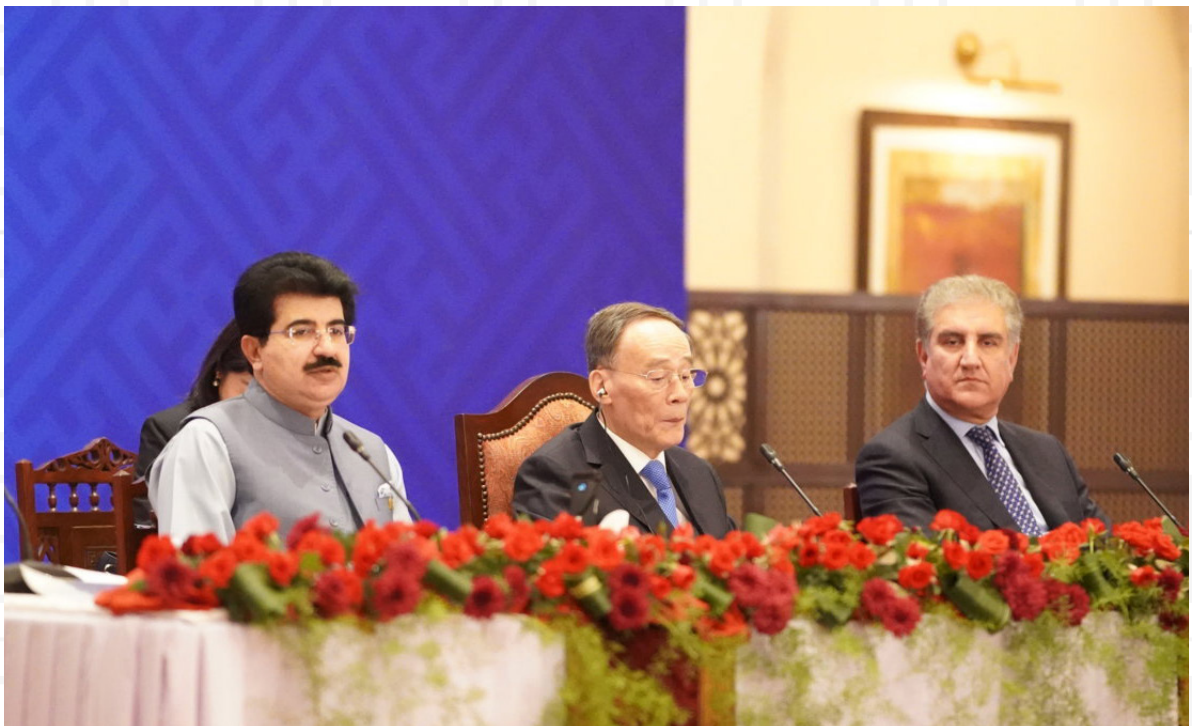
From L-R: Mr. Muhammad Sadiq Sanjrani ; H.E. Wang Qishan ; Mr. Shah Mehmood Qureshi.