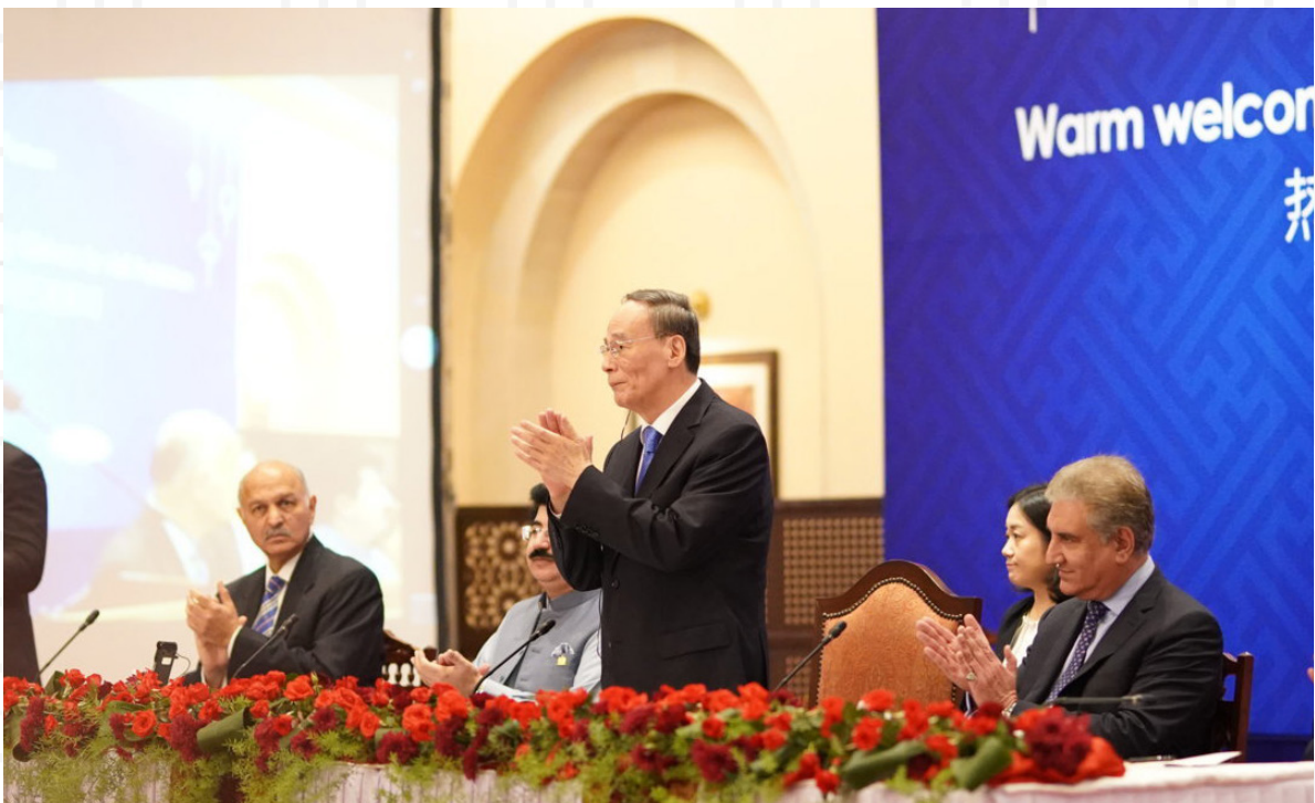
H.E. Wang Qishan responding to the applause of the audience.