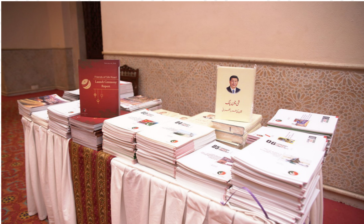
Publications of PCI on display, including the Urdu translation of the book by President Xi Jinping.