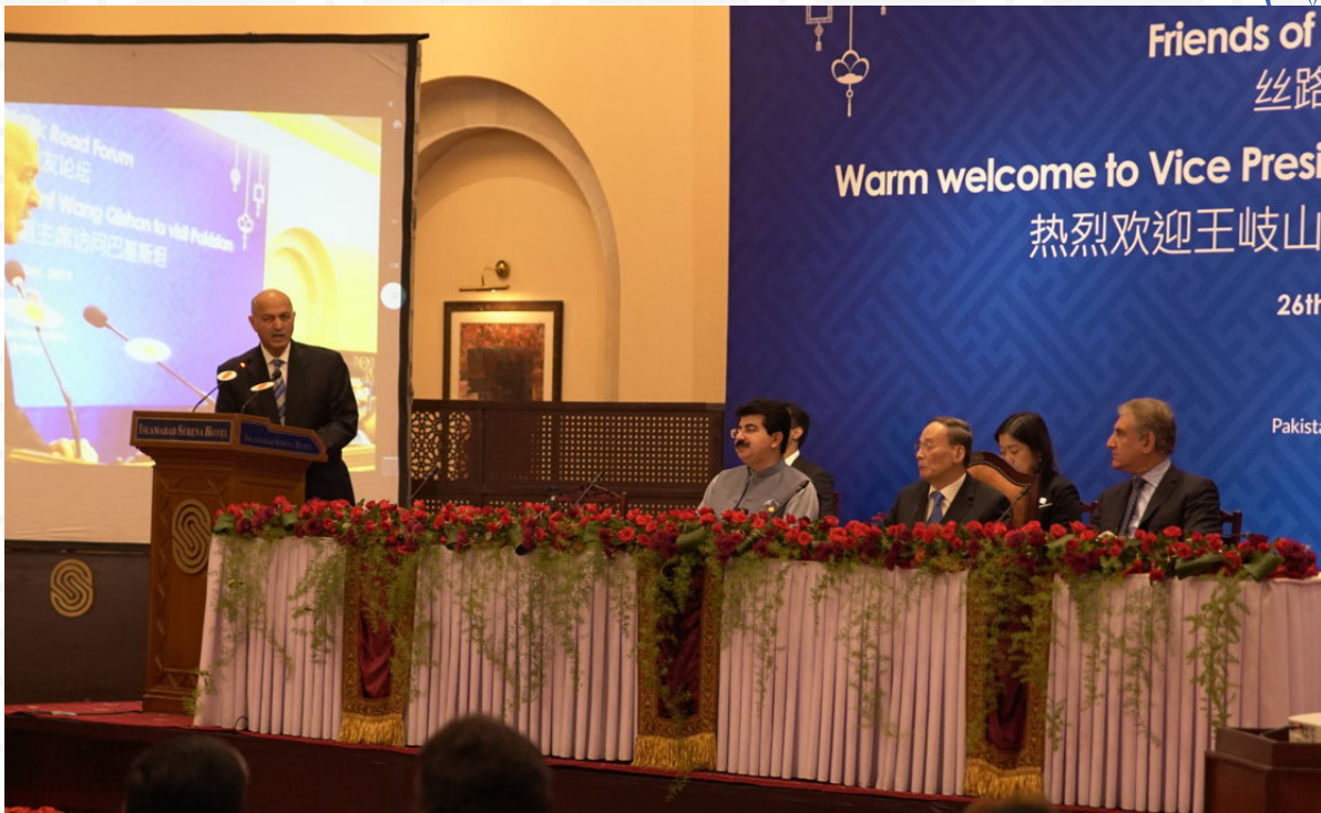
Senator Mushahid Hussain making the inaugural speech.