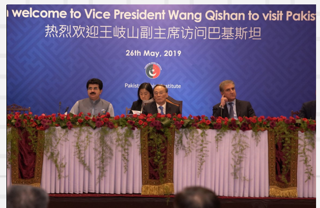
Mr. Muhammad Sadiq Sanjrani; H.E. Wang Qishan, Vice President of China and Mr. Shah Mehmood Qureshi.