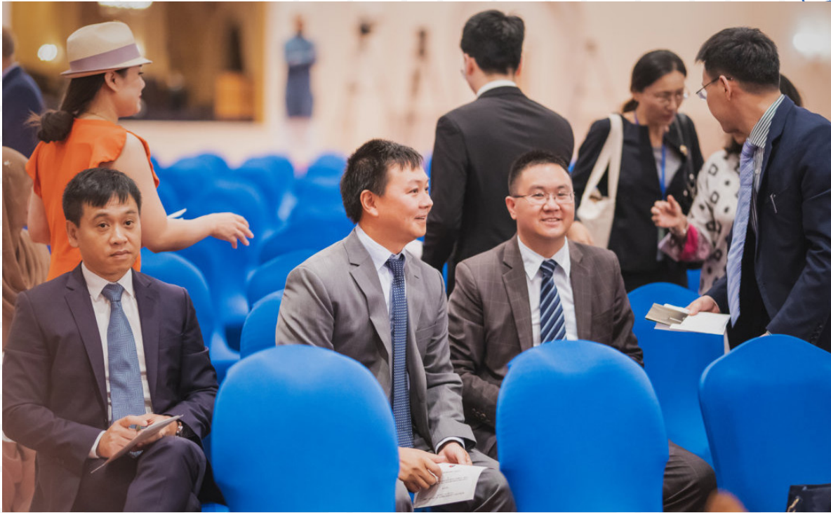
Group of Chinese guests waiting for the function to start.