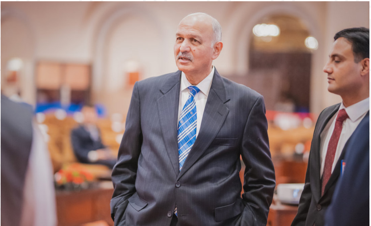
Senator Mushahid Hussain waiting to welcome the guests.