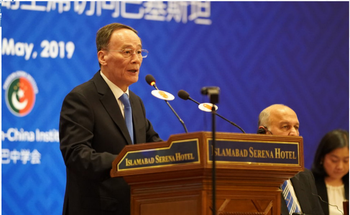
H.E. Wang Qishan addressing the Friends of Silk Road Forum.