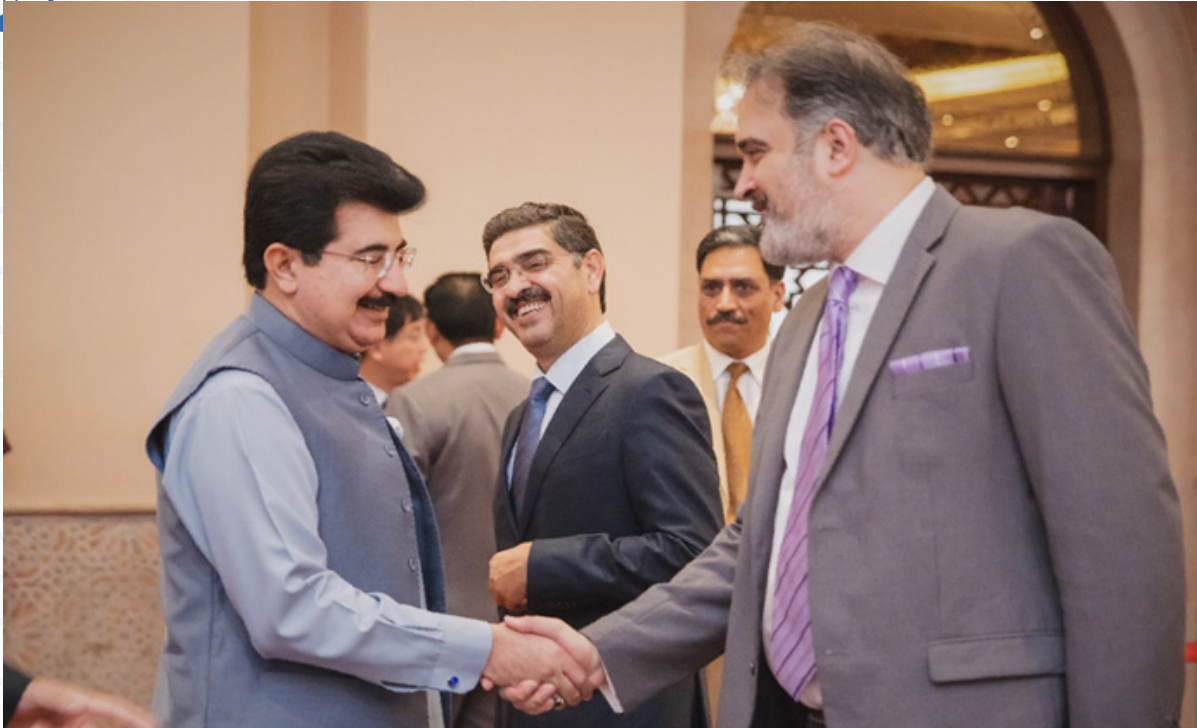
From L-R: Senator Mushahid Hussain; Mr. Shah Mehmood Qureshi; Mr. Syed Shibli Faraz; Mr. Qasim Suri, Deputy Speaker of National Assembly and Mr. Muhammad Sadiq Sanjrani.