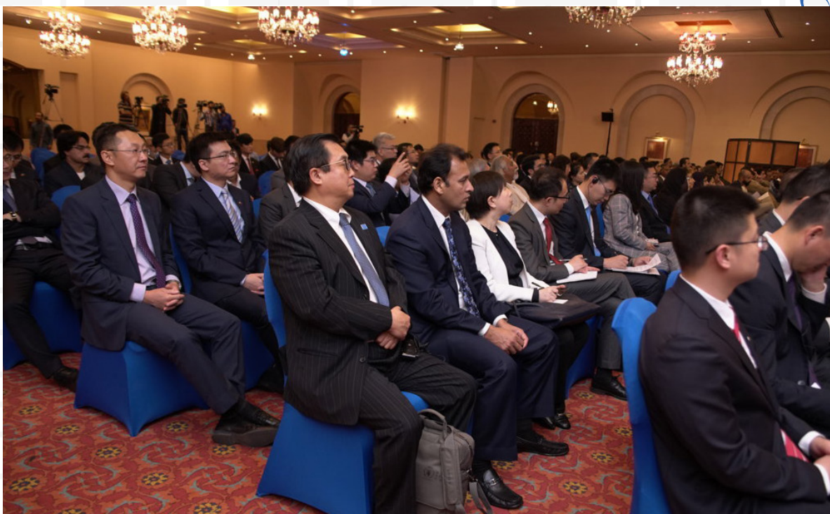
A number of Chinese visitors including CEOs of Chinese companies.