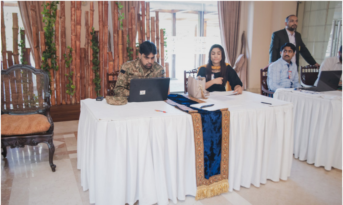
Security screening along with the help of Pakistan Army of each guest.