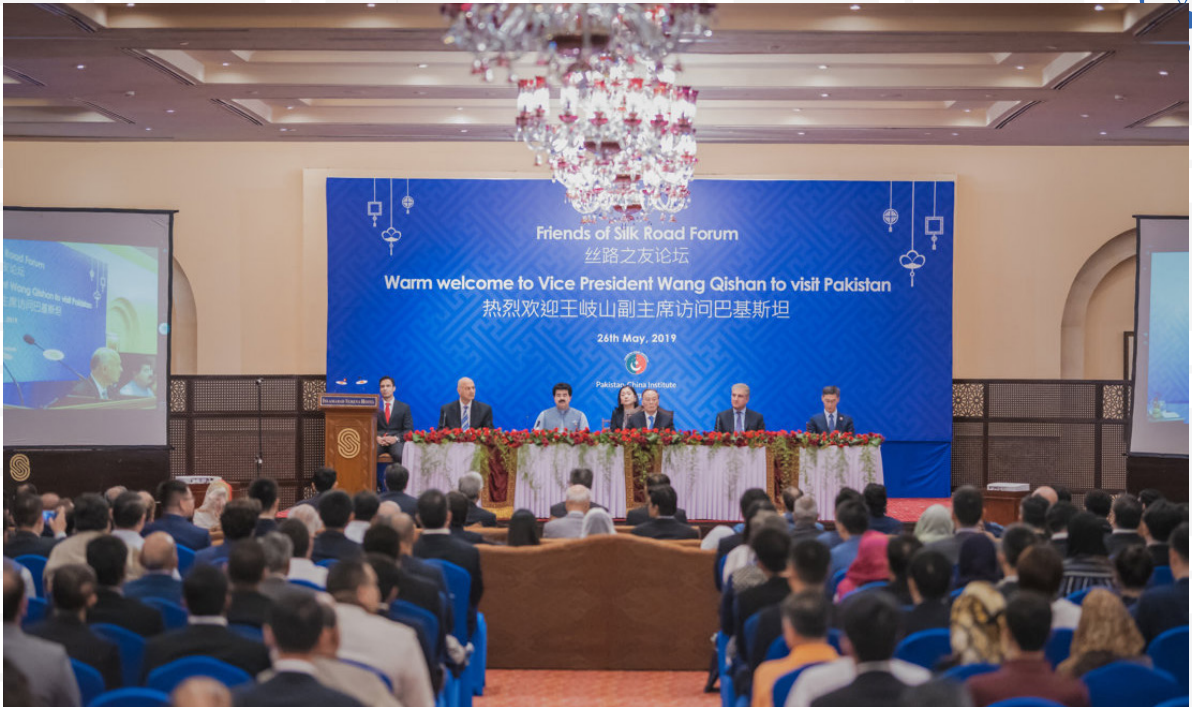
The Friends of Silk Road Forum